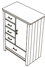
Como Door Chest – 2067 W:42 x D:21 x H:54