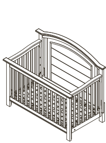
Como Forever Crib – 2600 W:59 x D:31 x H:48