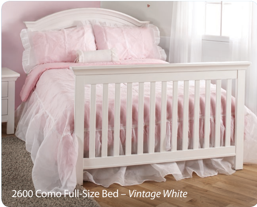
2600 Como Full-Size Bed – Vintage White