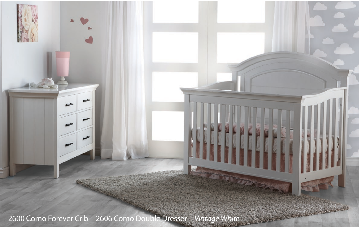
2600 Como Forever Crib – 2606 Como Double Dresser – Vintage White