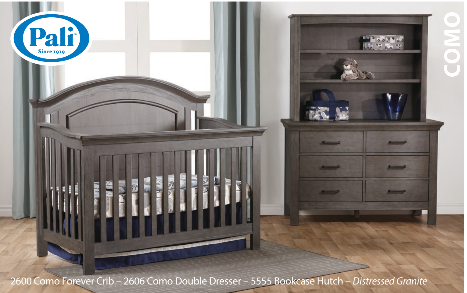
2600 Como Forever Crib – 2606 Como Double Dresser – 5555 Bookcase Hutch – Distressed Granite