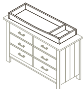
Changing Tray – 9900 W:46 x D:19.5 x H:5