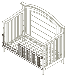
Como Toddler Rail – 1515 W:59 x D:31 x H:48