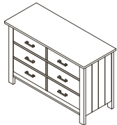
Como Double Dresser – 2606 W:52 x D:21 x H:34.5