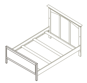
Low-profile Footboard – 6666 W:59 x D:80 x H:46